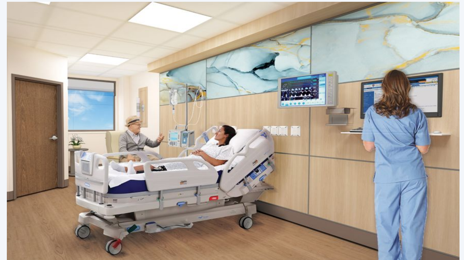
Intensive Care Unit