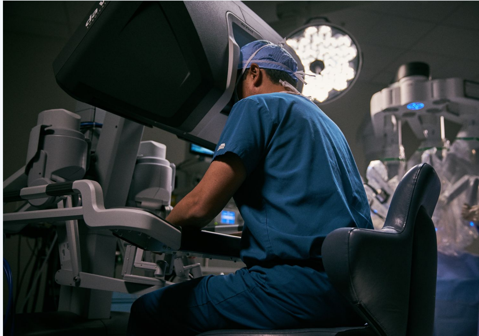
Two da Vinci Robots