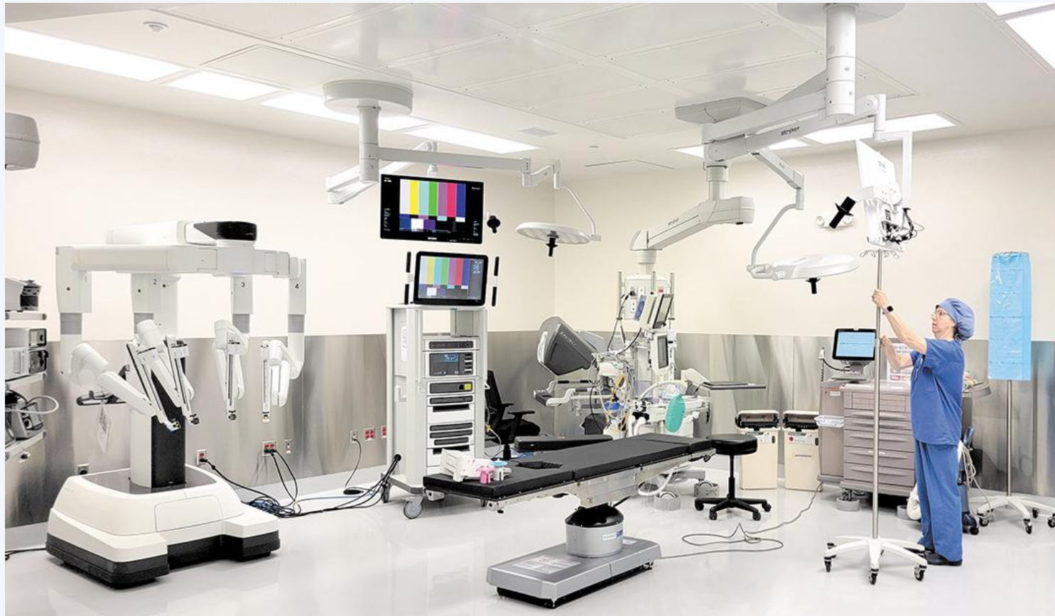
Kaplan Center for Surgical Services 4 Operating Rooms; 2 Procedure Rooms