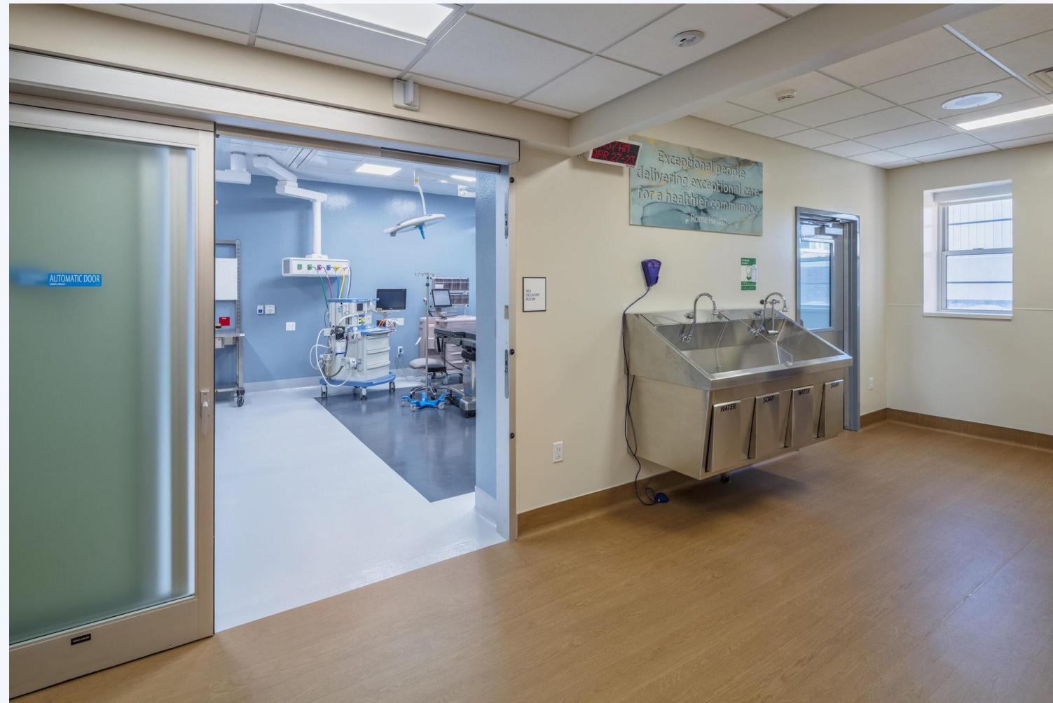
Obstetrical Operating Room C-section Suite