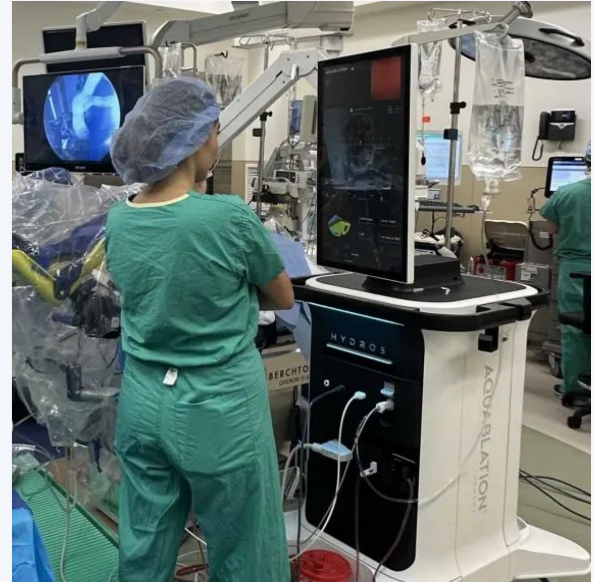
Aquablation for Prostate Care